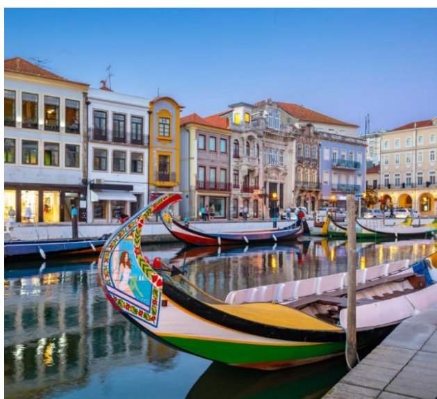
Ria de Aveiro

Aveiro, next to the sea and the ria (estuary), is crossed by a network of channels through which moliceiros (local boats) meander. These slim, colourful vessels used to be used to collect algae and seaweed, and today are for sightseeing trips. The city has a number of buildings in Art Nouveau style that are worth seeing. Many are situated along the main channel, but there are some off the beaten track and in other locations.