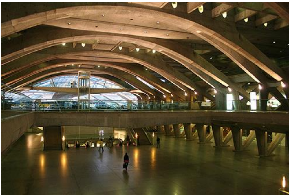
Oriente Station (Lisbon)

As the trip from Lisbon to Aveiro is longer, it is better to use the fast trains Intercidades or Alfa .