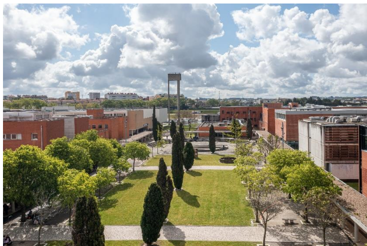
University of Aveiro

Another important place to visit is the Aveiro Museum in the Convent of Jesus, where you can admire the Mausoleum of Princess Saint Joana and the gilded woodcarvings that decorate the interior of the church. These are to be found in abundance in the chapel of Senhor das Barrocas and with less exuberance in the Misericórdia Church, whose mannerist portal deserves mention. Those who appreciate contemporary Portuguese architecture should not miss the University buildings .