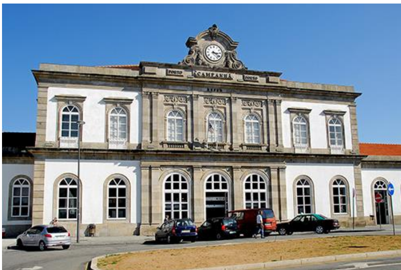
Porto Campanhã – train station

Taxi costs about 25€ and takes about 20 minutes. The Metro (título Z4) costs about 3.00€ and takes 40 minutes to reach Porto – Campanhã station (Line E: Aeroporto – Estádio do Dragão).